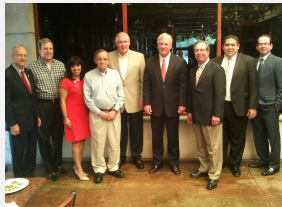
SAYLA Past Presidents at June luncheon.